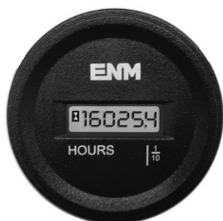
L3 7 DIGIT COUNTER L4 6 DIGIT HOUR METER